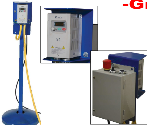
Movable Control Stand