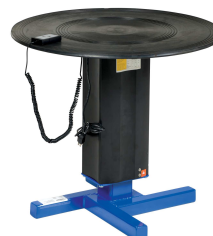
Powered Height Turntables