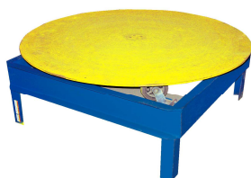
Stand-Alone Powered Carousels