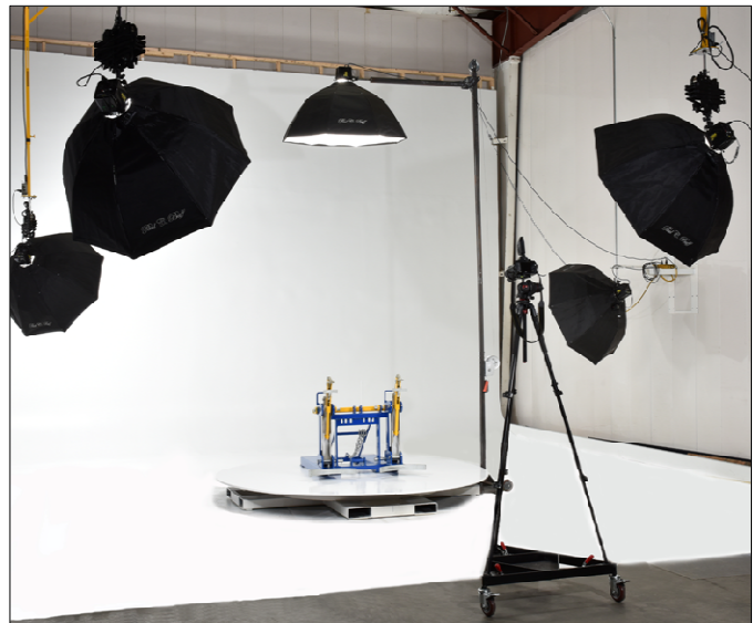
Vestil utilizes this very technology for in-house use!