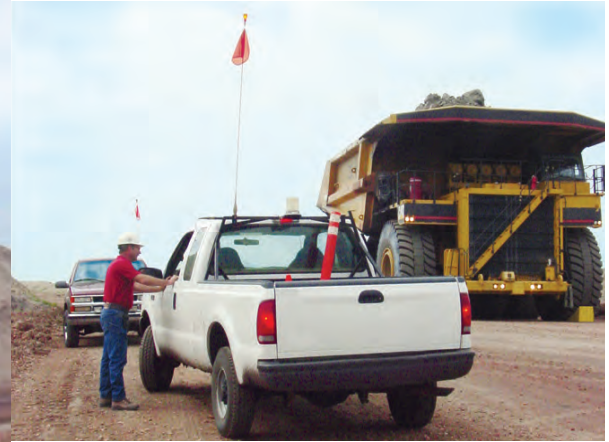
PICTURED: AP WHIP IN USE

⚠ WARNING: This product can expose you to chemicals including Nickel Compounds, which is known to the State of California to cause cancer and birth defects or other reproductive harm. For more information go to www.P65Warnings.ca.gov .